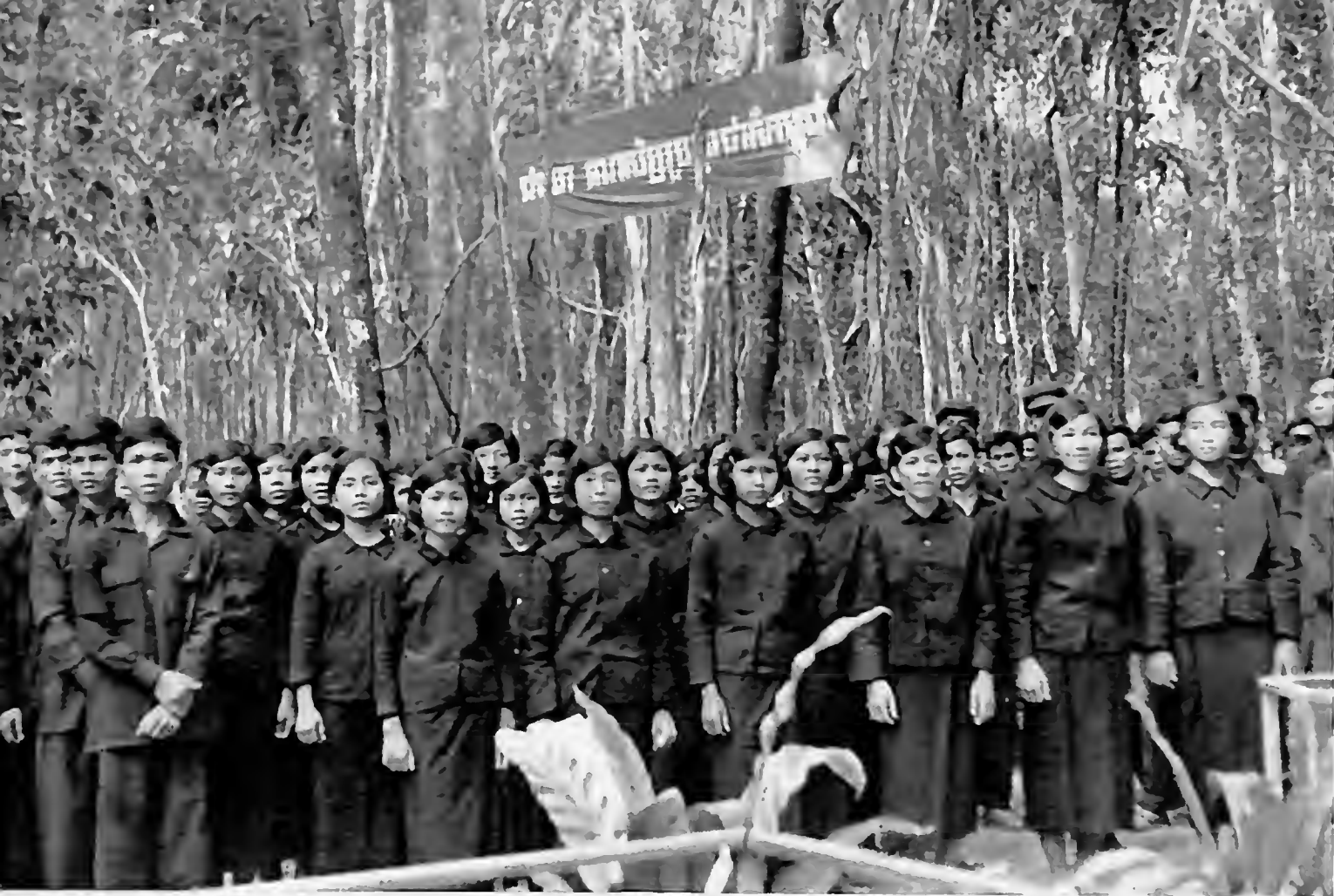
Youths led by the N.U.F.C.